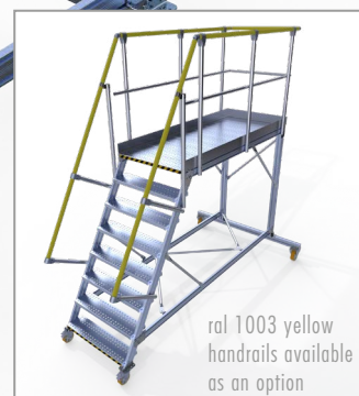
ral 1003 yellow handrails available as an option