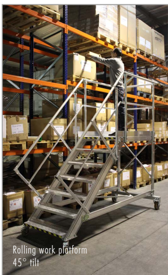
Rolling work platform 45° tilt